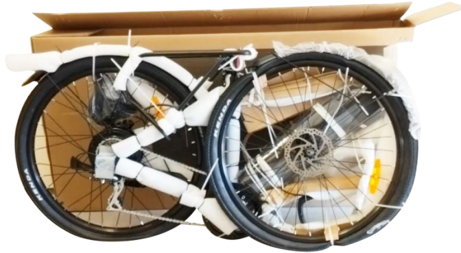
Figure 2: Saddle and separate box with: pedals, charger, and toolkit.

Figure 1: Bike frame, bike box, saddle, additional box of parts (Figure 2), front wheel, axle skewer, and handlebars, all zip tied together and padded.